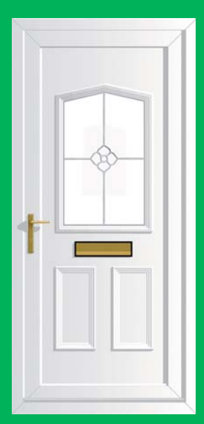
Jacobean 1 SILVER GRILLE