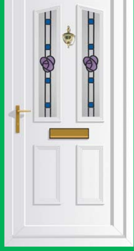
Windsor 2 RENNI TIREE