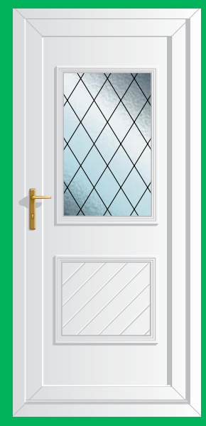
Diamond Lead / DIAGONAL BOTTOM