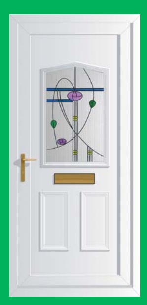
Jacobean 1 RENNI MORAY