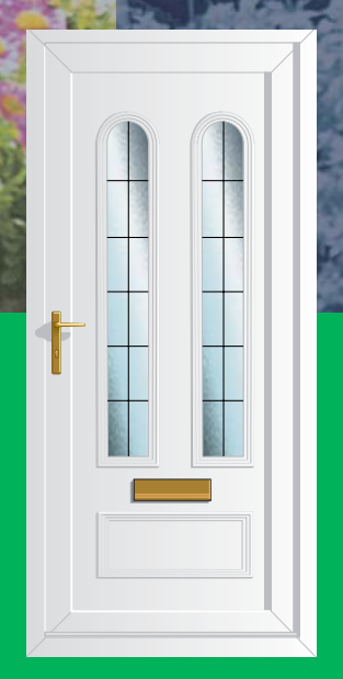
Cambridge 2 BLOCK LEAD