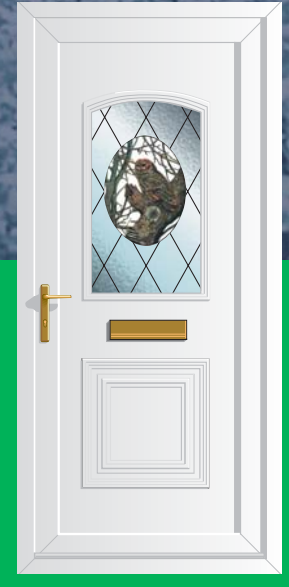
Victorian $1 OWL