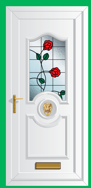
Regal 1 SUMMER ROSE