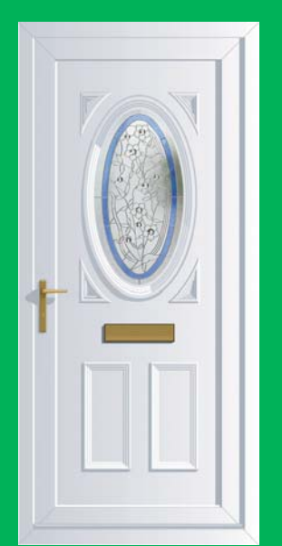
Warwick S1 TIFFANY SAPPHIRE