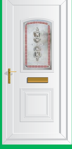
Victorian S1 RUBY