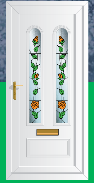
Cambridge 2 CLIMBING ROSE