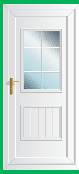
Georgian Bar / VERTICAL BOTTOM