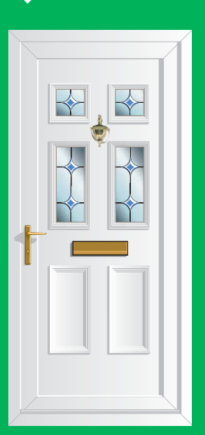
Edwardian 4 BEVEL G