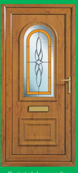
llustrated above are the Mahogany (top) and Light Oak effects