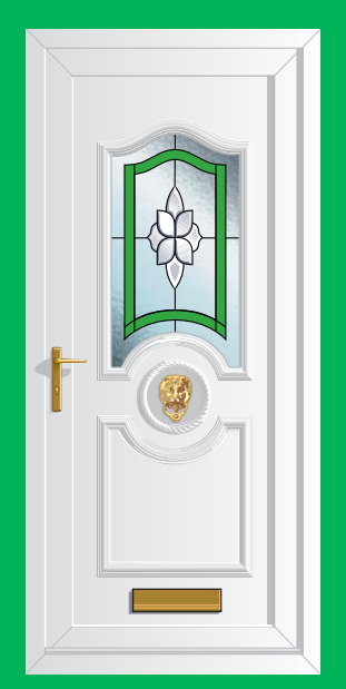
Regal 1 BEVEL C