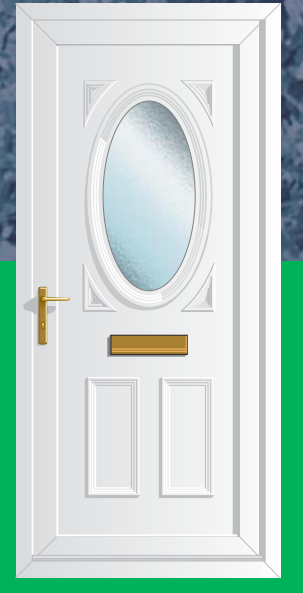
Warwick $1 GLAZED