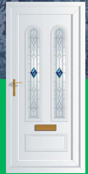
Cambridge 2 FUSED BLUE