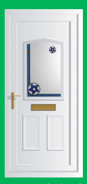
Jacobean 1 RENNI STAR