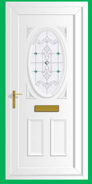
Warwick S1 EMERALD ELIPSE