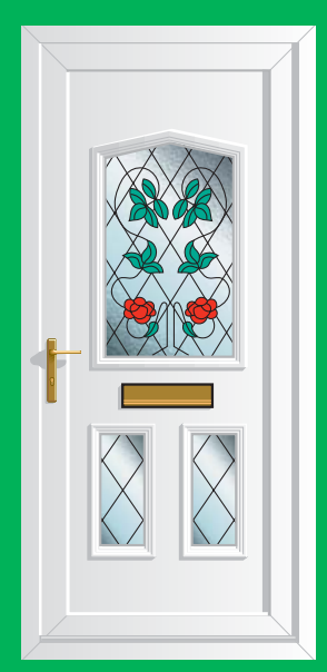
Jacobean 3 CLIMBING ROSE