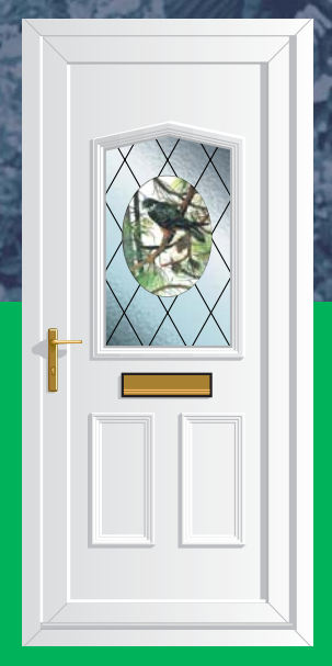
Jacobean 1 HAWK