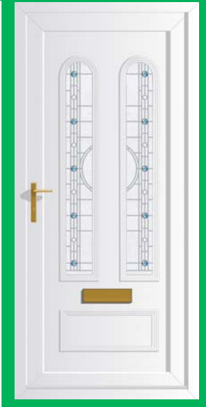
Cambridge 2 AQUA JEWEL