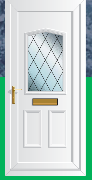
Jacobean 1 DIAMOND LEAD