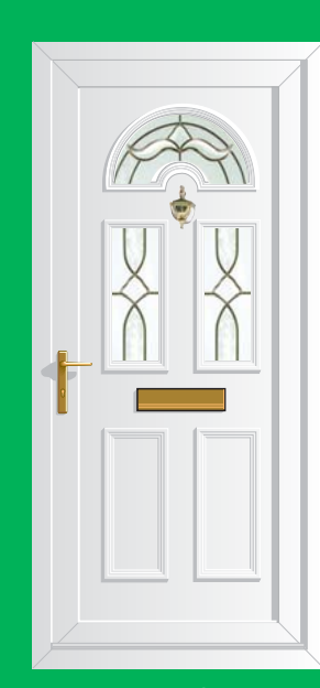
Georgian 3 SIRIUS