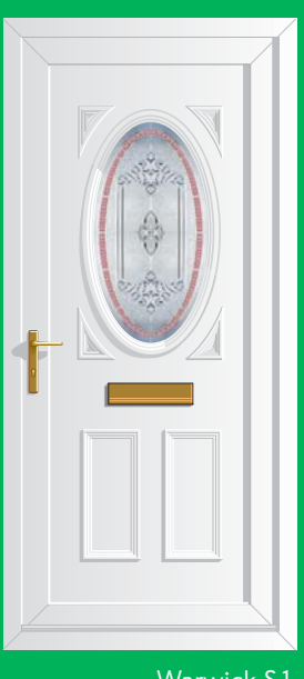
Warwick $1 BRIGHT RUBY