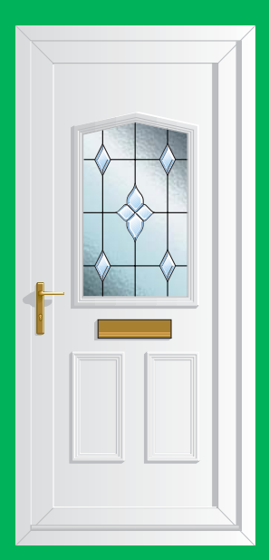
Jacobean 1 BEVEL A