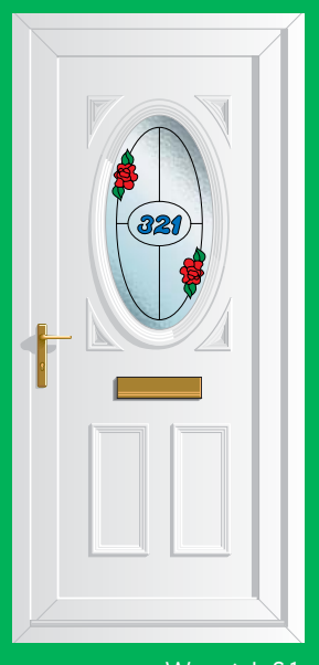
Warwick $1 HOUSE NO. / ROSES