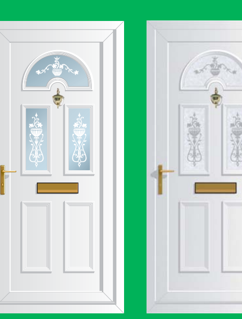
Georgian 3 FLORAL URN ETCHED Georgian 3 CLEAR ELEGANCE