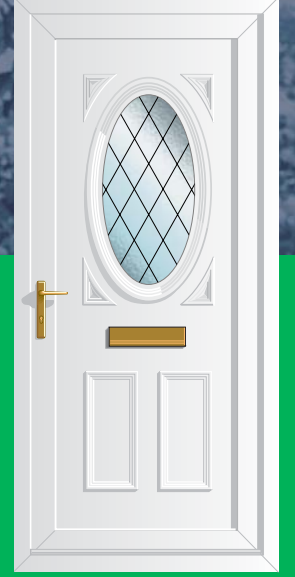
Warwick S1 DIAMOND LEAD