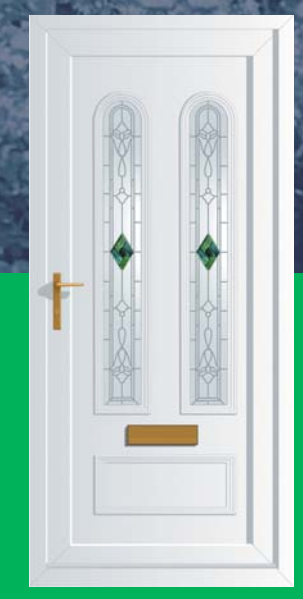
Cambridge 2 FUSED GREEN