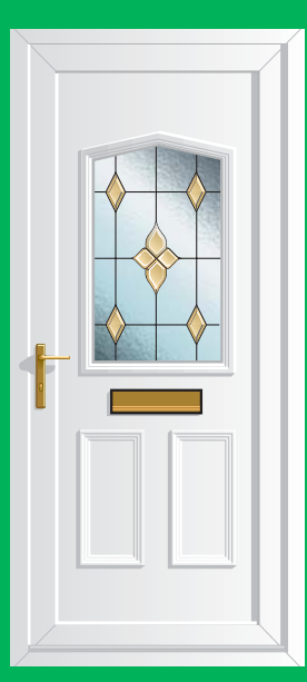
Jacobean 1 BEVEL F COLOURED