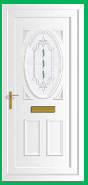
Warwick $1 TRIO GREEN