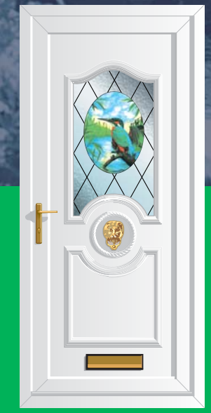
Regal 1 KINGFISHER