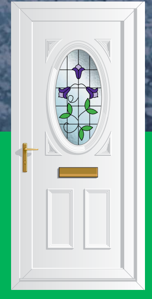
Warwick $1 TRAILING BELL FLOWER