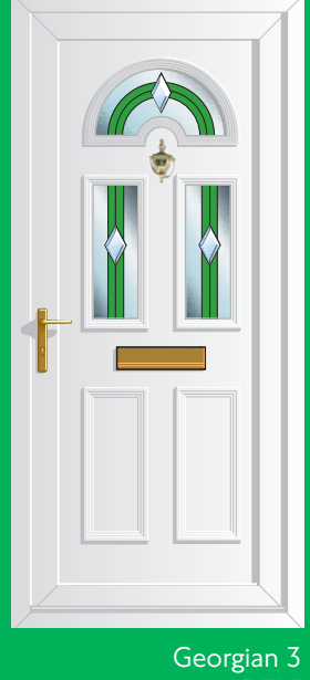
Georgian 3 BEVEL E