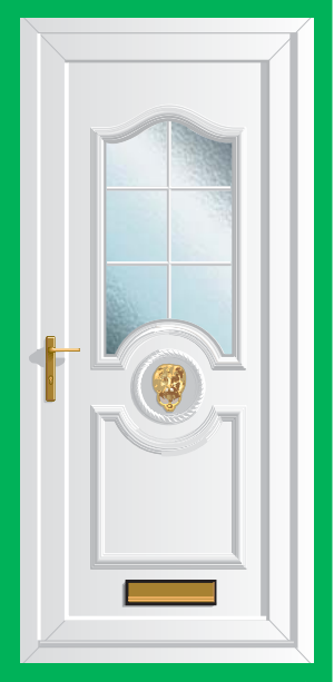
Regal 1 GEO BAR