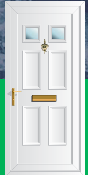
Edwardian 2 GLAZED