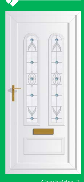
Cambridge 2 AQUA PETAL