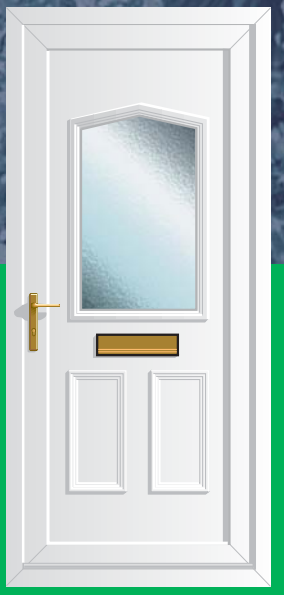
Jacobean 1 GLAZED