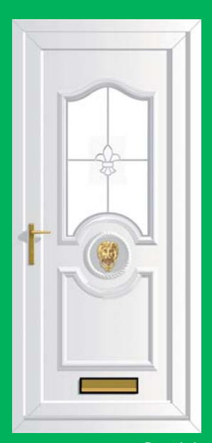
Regal 1 SILVER GRILLE