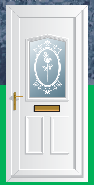
Jacobean 1 TEA ROSE ETCHED