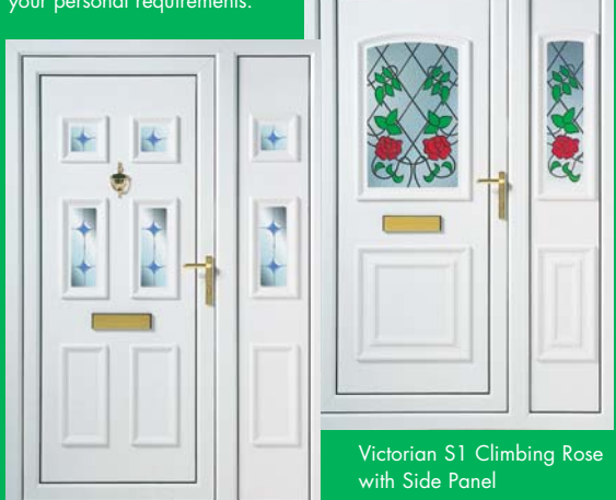
Edwardian 4 Bevel G with Edwardian 2 Bevel G side panel

we would be happy to discuss your personal requirements.